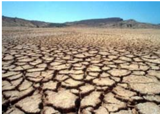
Popenguine, Senegal.

"Man is no longer the Creator's 'steward,' but an autonomous despot, who is finally beginning to understand that he must stop at the edge of the abyss." 5