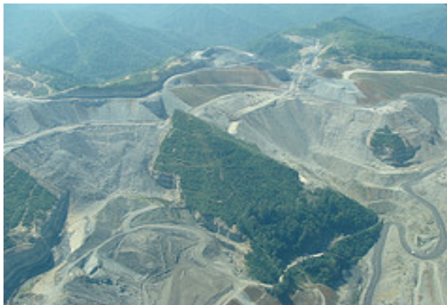
West Virginia mountaintop removal mining

http://creativecommons.org/licenses/by-nc-nd/2.0/