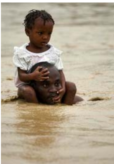
Port-au-Prince, Haiti.

"Examine what is offered to you as progress. We have to be alert if we are to defend this planet and live on it effectively. Regarding the environmental protection, concerns long ceased to be only for the present moment, because we also have a concern for future generations. We must draw conclusions from the limits and hazards of growth. We must not do all that we are capable of doing. Asceticism, self-restraint, self-denial has suddenly become fashionable again. These virtues are vital to man's survival." 17